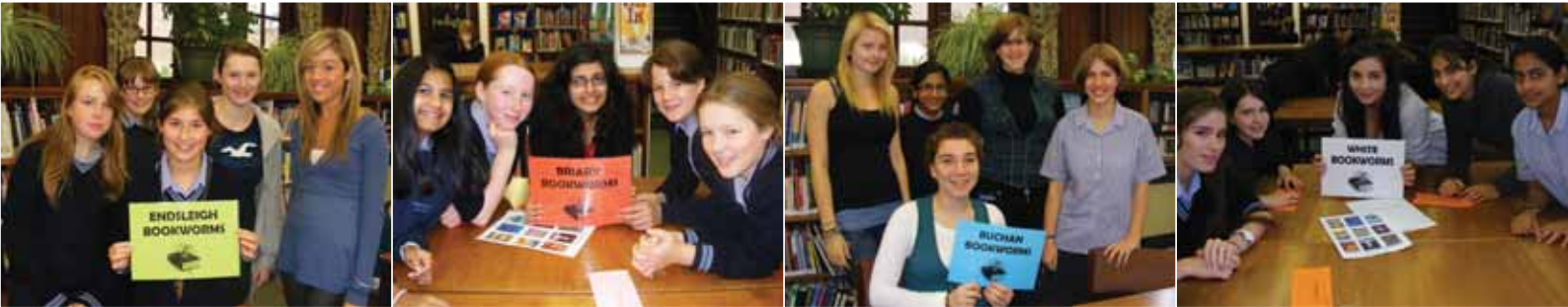
The House Book Quiz

was won by Briary – meaning that Buchan is the only House never to have won this event. Being a proud Buchan member, this pains me more than words can say.