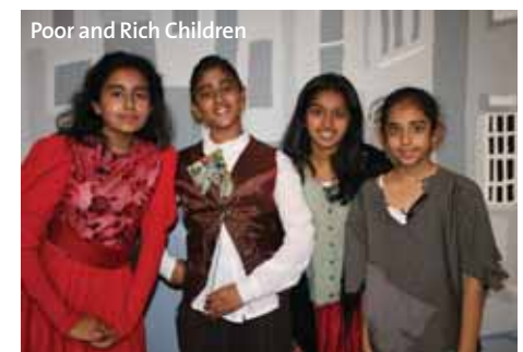
Poor and Rich Children