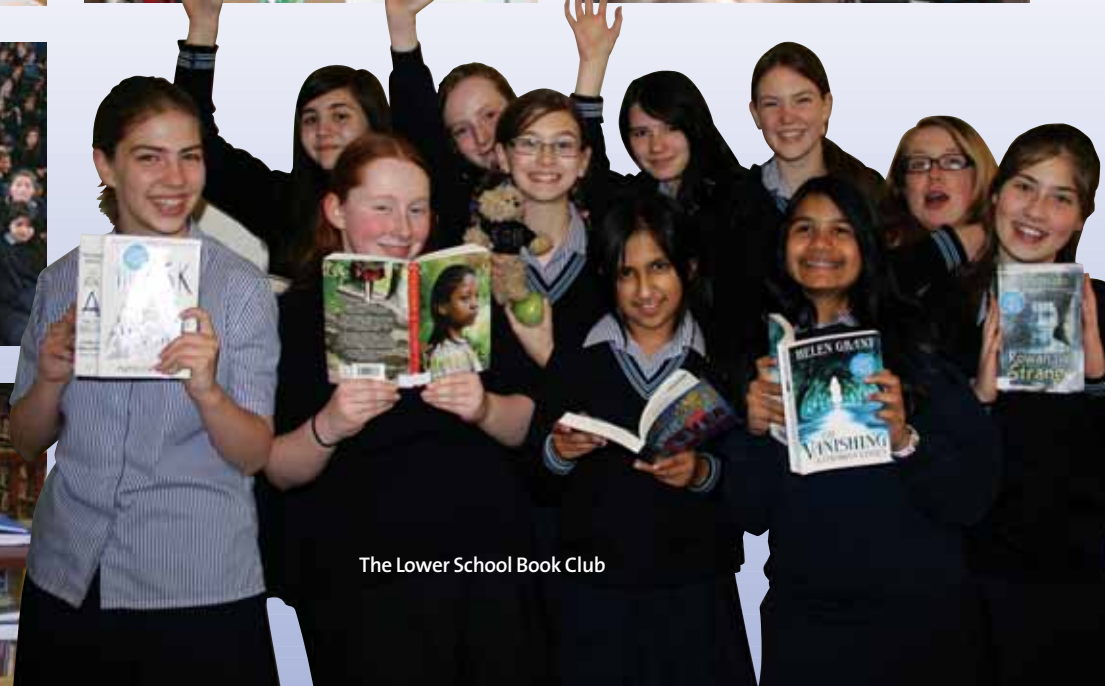
The Lower School Book Club