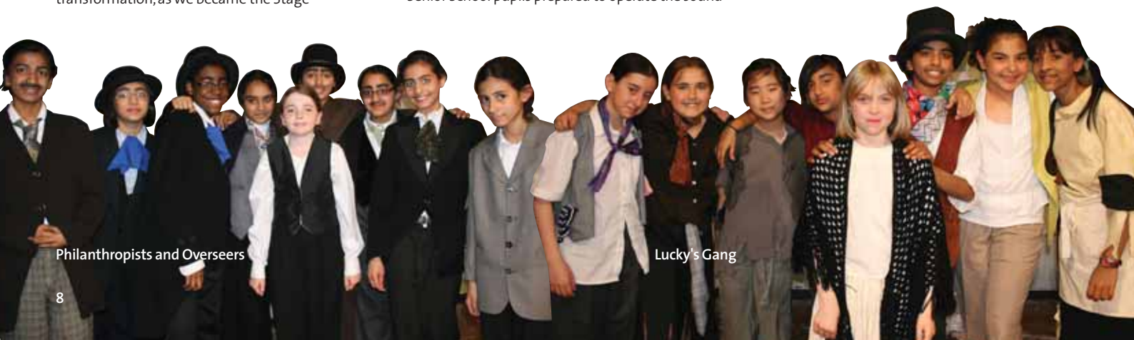
Philanthropists and Overseers